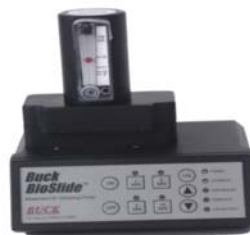
BUCK BioSlide™ Model B1020 Pump is shown with Gel-Impaction Slide and APB-706220 Calibration Rotometer Assembly

Calibration of the BUCK BioSlide™ Model B1020 Pump is fast and easy. The supplied calibration Rotometer assembly fits securely on top of the Gel-Impaction Slide with no leakage, so all your sample airflow goes through the Gel-Impaction Slide. Flow calibration with an actual slide in-line ensures an accurate and repeatable calibration, without substitute restrictors, bubble tubes, or other fittings.